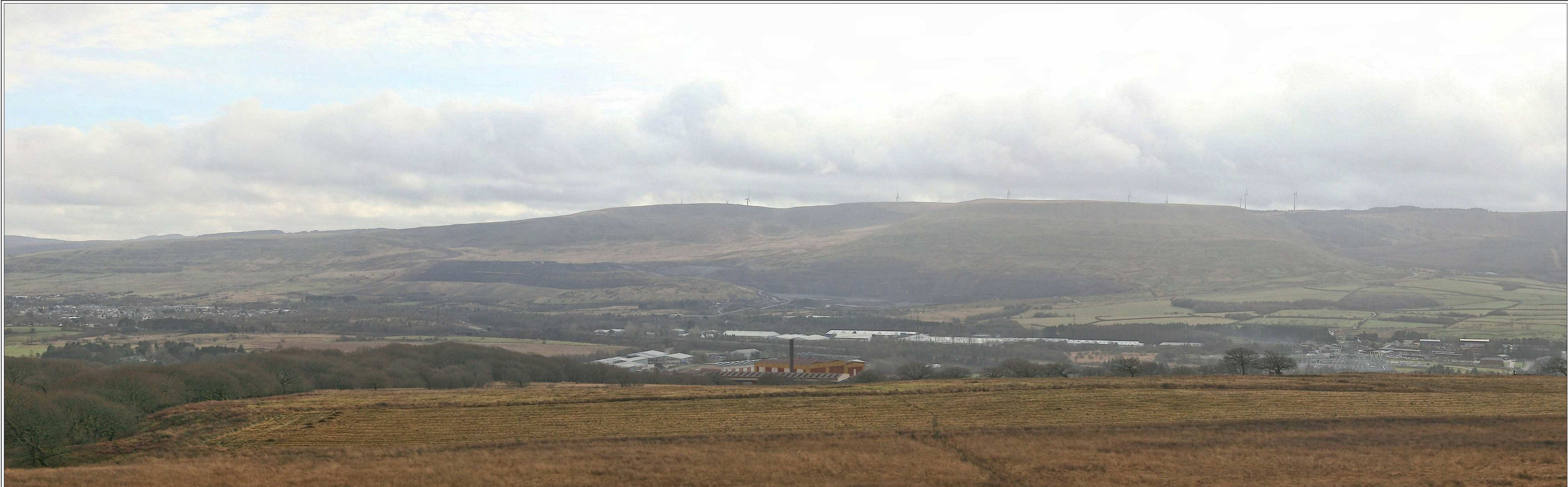
Photomontage Year 1