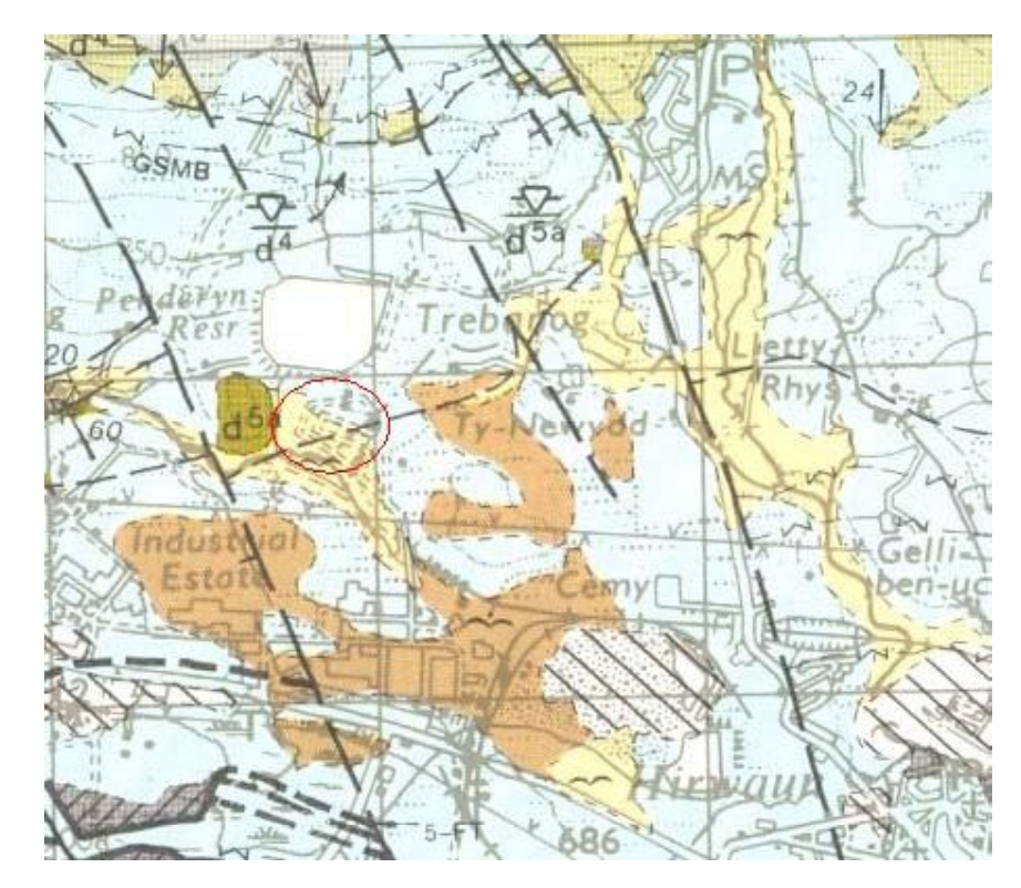
FIGURE 2 GEOLOGICAL MAP