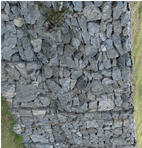
TYPICAL EXAMPLES OF STONE GABIONS