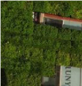
TYPICAL EXAMPLES OF GREEN WALL SYSTEMS