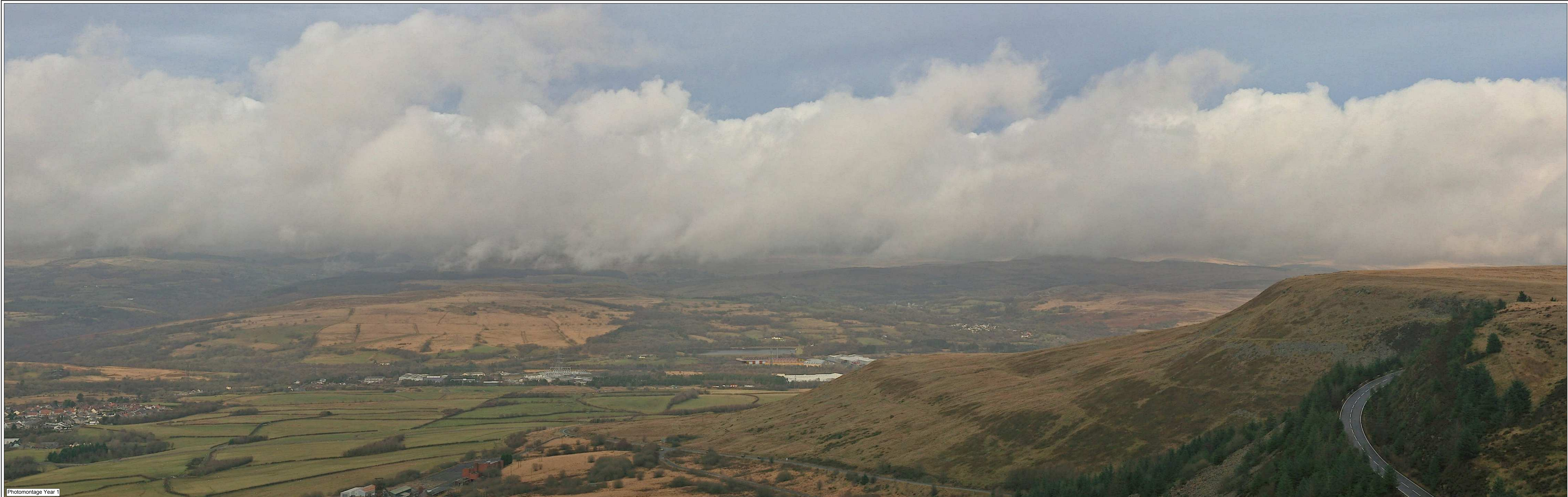
Photomontage Year 1