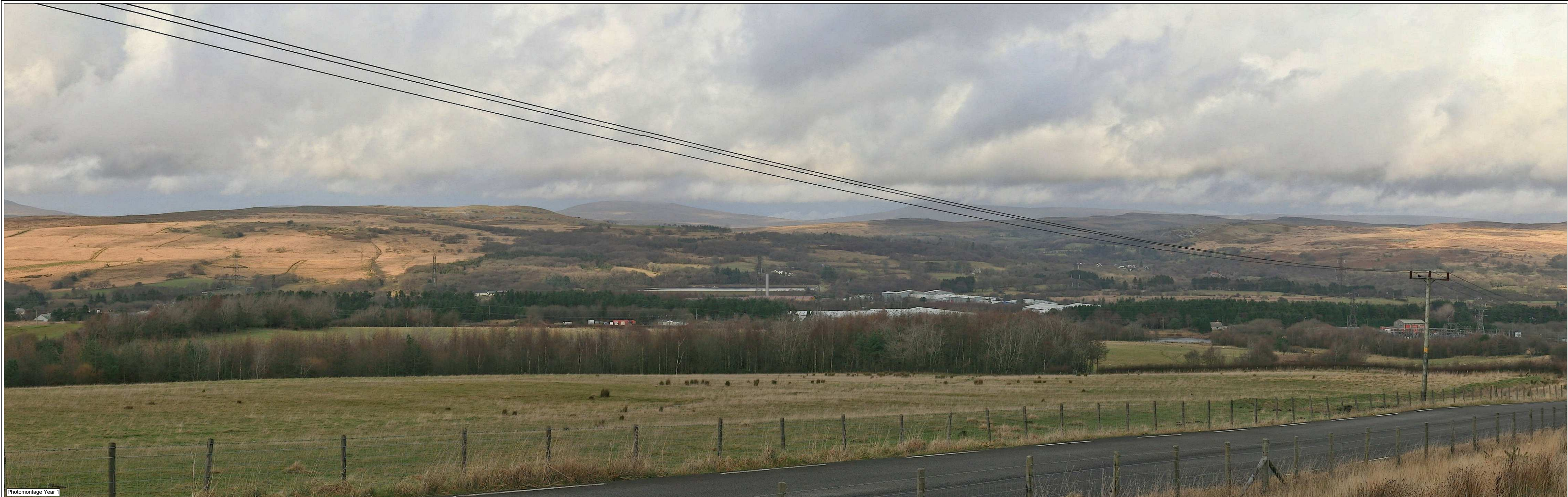
Photomontage Year 1