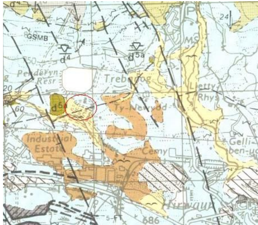
FIGURE 2 GEOLOGICAL MAP

Site location highlighted by red circle. Taken from Geological Map BGS (Solid and Drift Edition) Merthyr Tydfil Sheet 231. 1:50,000 Series Copyright and Scanning Licence Number C07/124-CSL. British Geological Survey © NERC. All Rights Reserved.