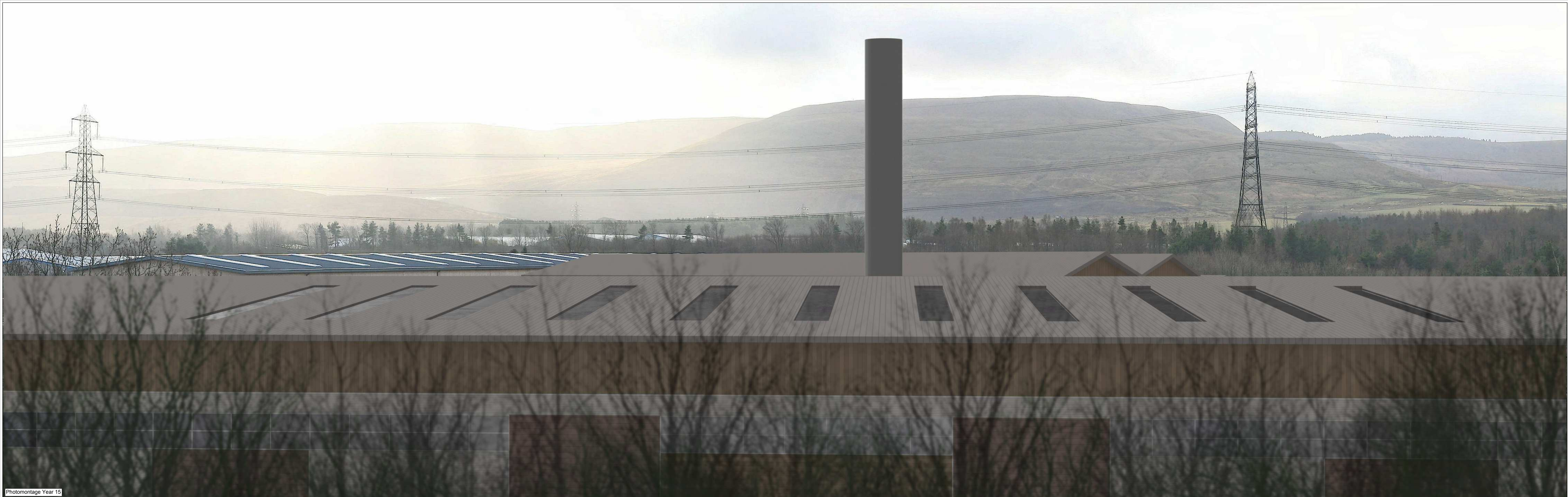
Photomontage Year 15